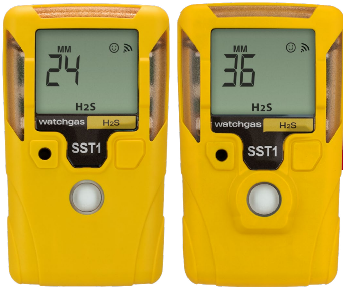
SST1 Micro sensor