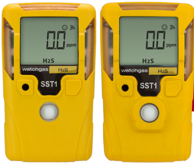
SST1 Micro sensor